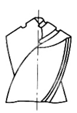
Figure 3: Chip Dividing Groove Drill

For the bigger diameter of twist drill, should to grind staggered narrow slot on the Rake Face and Major Flank Face of twist drill bit. Review figure 3.To keep the cutter edge is narrow, and to improve the condition of chip removal and chip dividing, it is helpful to inject more cutting fluid, improve heat dissipation condition, also to improve drilling quality and drilling efficiency. At the same time, during regrinding chisel edge that has better drilling effect.